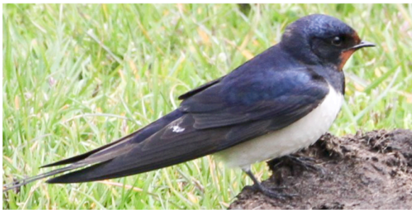
A swallow (above) collecting material for its nest after arriving from its ten thousand kilometer journey.

Pictured above Arctic Terns that may fly a 35,000 K round trip each